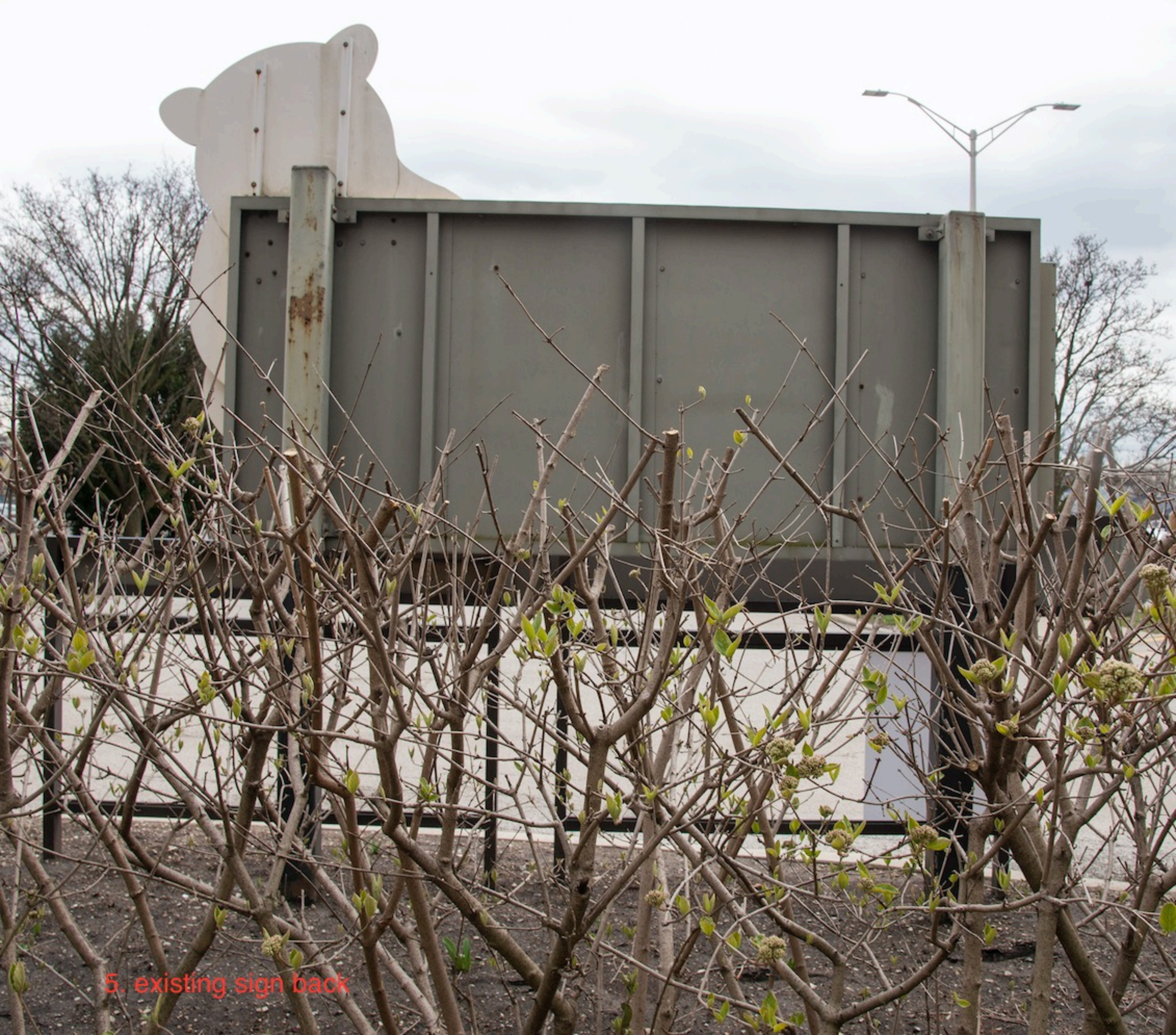
5. existing sign back